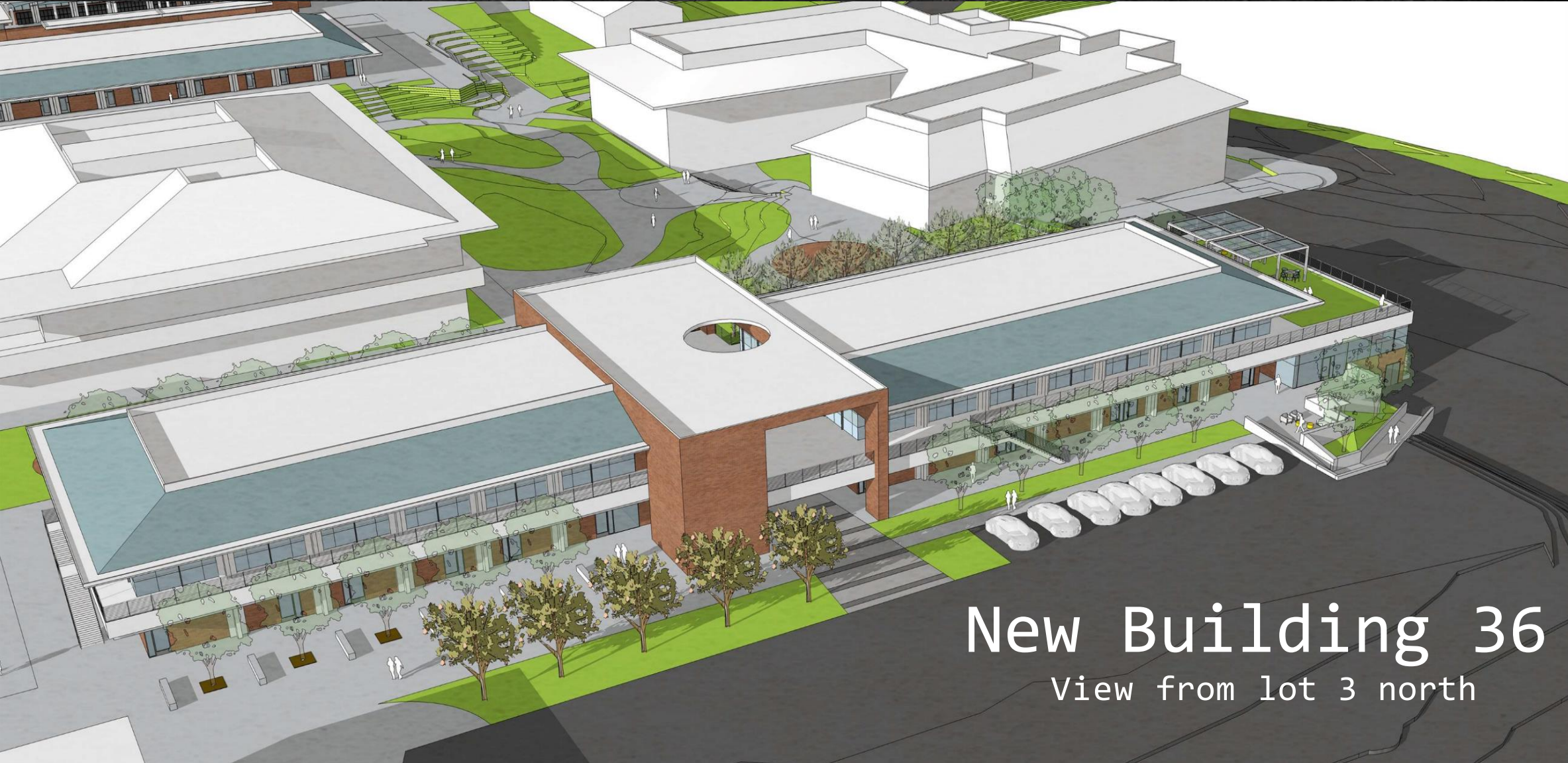
New Building 36 View from lot 3 north

Demo Starts Spring 2020 / Completion Fall 2021